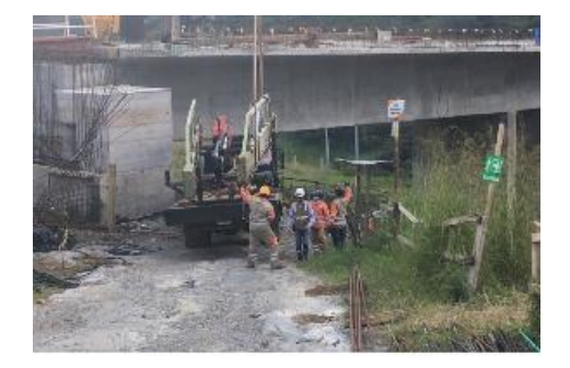
Properly Health and Safety activities