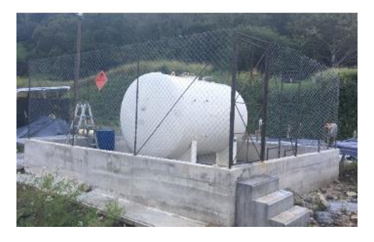
Adequate control spill infrastructures