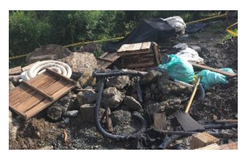
Inadequate storage of wastes and excavation material