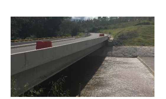
Finished water occupations in UF 1