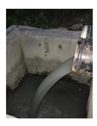
Color and Turbity in wastewater discharge (tunnel UF3)