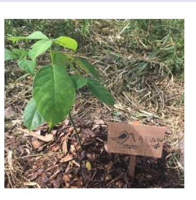
UF 1 Compensation Activities